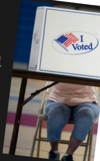
UNITED STATES – NOVEMBER 5: gymnasium on Election Day Tue Read More

RICHMOND, Va. (WRIC) — Voter turnout across the state of Virginia was down this 2024 General Election, especially in localities considered to favor Democratic candidates. While Vice President Kamala Harris (D) may have won Virginia's 13 electoral votes on Election Day by several percentage points, President-elect Donald Trump (R) is set to return to the White House in Jan. 2025, following a strong performance in many other states.